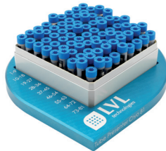
SAFE® Tube Presenter 81