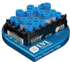
SAFE® Tube Presenter 24

The Tube Presenter from SAFE® is the simple tool for processing and checking out individual samples: simply insert the single pin into the appropriate position, place the rack on top, and the upright tube can be removed safely and easily. The column pin can be used for entire columns, which simplifies the handling of entire sample series. This well-designed solution reduces the workload for laboratory staff and contributes to a smooth workflow by minimizing the risk of errors and maximizing productivity. The Tube Presenter is compatible with various rack formats and offers flexible and reliable support for everyday laboratory work. With its robust and durable construction, it is an indispensable tool for any laboratory that values precision and efficiency.