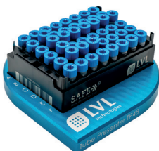
SAFE® Tube Presenter 48