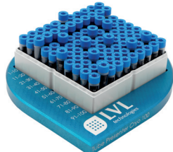
SAFE® Tube Presenter 100