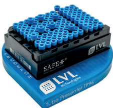
SAFE® Tube Presenter 96