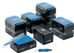
Starter Pack Small

The SAFE® Starter Packs are ideal for laboratories looking to optimize their sample storage while keeping an eye on costs. With the included SBS racks, you can organize your samples efficiently and in a space-saving manner. Our tubes are suitable for extremely low temperatures down to -196°C (LN2) and offer the highest levels of security and identifiability for your samples.