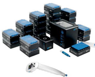
Starter Pack Medium