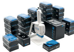
Starter Pack Large