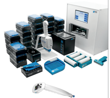
Starter Pack Complete